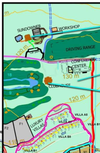
VIPINGO RIDGE MAIN RESORT CLOSE UP